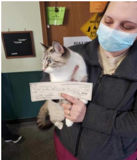
Representative (and Resident) of Humane Society of Southern Illinois display Elk's #572 Check for $500, from Grant funding.