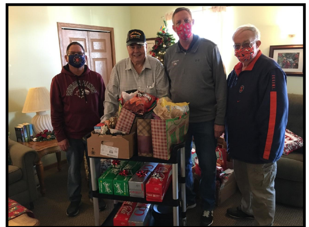
Member of Lodge 572 visited with veterans in Southern Illinois veteran living facilities. They delivered presents and made everyone feel welcome and appreciated.