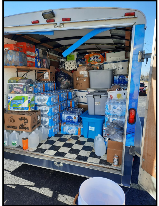
Members of Lodge 572 coordinated with Marion Illinois Lodge 800 and Marshall County Kentucky Elks to help the needy victims of the Mayfield tornado get what they needed. Members in our area delivered 3 shipments of supplies to help those in need.