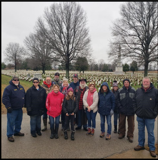
Members of Lodge 572 joined with other Elks at Mounds National Cemetery to lay wreaths at the graves of Veterans to let them know they are never forgotten.