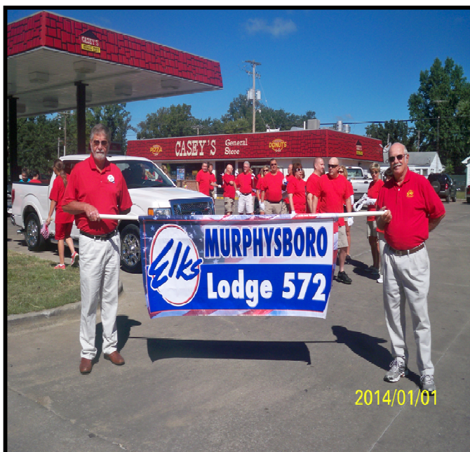
Elk's Flag team prepares for the Apple Festival Parade

CHRISTMAS SHOWCASE NOV. 6TH & (Possibility Nov. 7th) in Lodge Hall